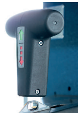
Nussbaum-Commander Lever for accurate operation, precise positioning and adjustable fine lowering

Original Mercedes-Benz accessories, such as: