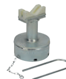
G-Class Adapter Art-No.: 0003254

Original Mercedes-Benz accessories, such as: